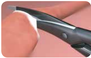
Cutting with bipolar coagulation