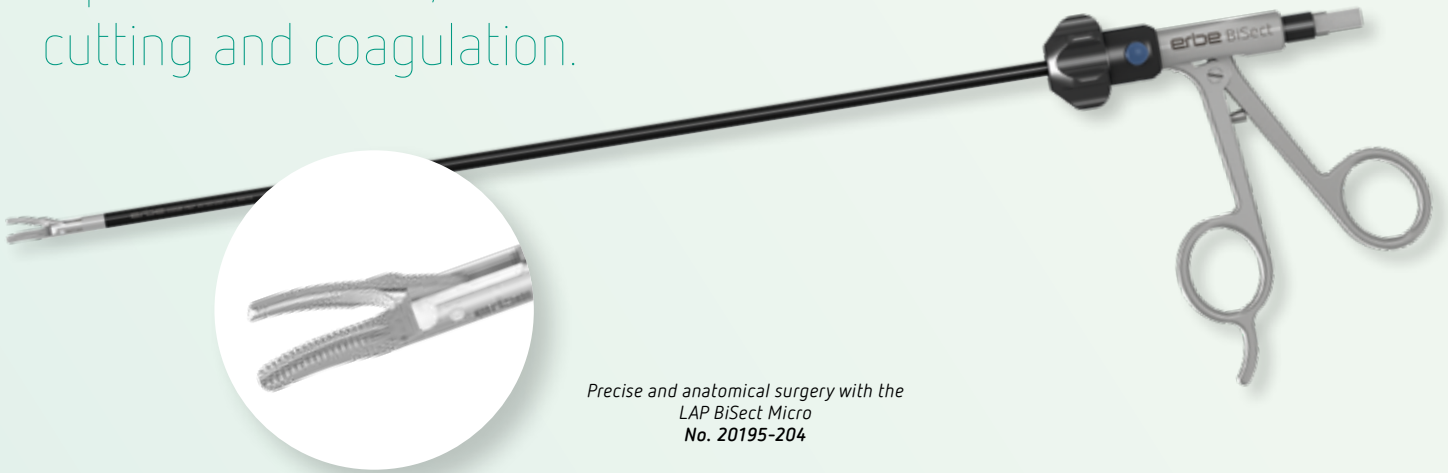
Precise and anatomical surgery with the LAP BiSect Micro No. 20195-204

Bipolar dissection, cutting and coagulation.