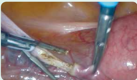
The blue pedal of the footswitch is used for coagulation, the yellow pedal for dissection

The Erbe technology of the VIO system and the units of the ICC series supports the CUT and COAG effects with the appropriate optimized modes and setting.